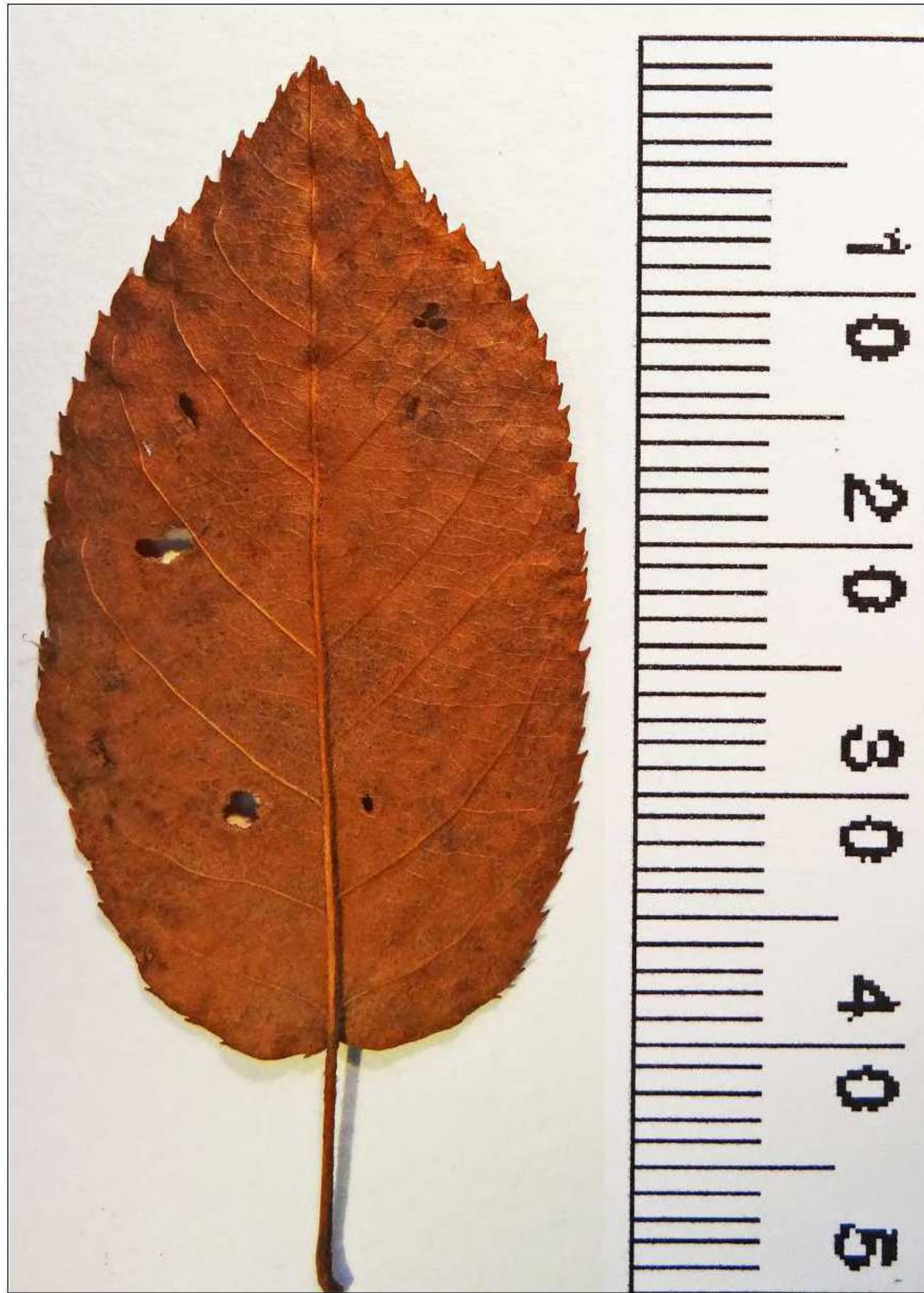
Figure 2. Amelanchier arborea . Leaf from dormant plant (Holmes, Singhurst, and Loos 15980, BAYLU).

Amelanchier arborea in Texas is a subcanopy tree growing under Fagus grandifolia , Quercus alba , Q. pagoda , Magnolia virginiana , Nyssa sylvatica , Ilex opaca , and Acer rubrum . Both sites also included Persea borbonia , Ilex coriacea , Cyrilla racemosa , Rhododendron spp., Hamamelis virginiana , Vaccinium arkansanum , V. elliotii , Ilex vomitoria , Crataegus marshalli , and Symplocos tinctoria . Woody vines in the vicinity included Smilax pumila , S. rotundifolia , and Gelsemium sempervirens . Herbaceous flora included Chasmanthium laxum , Xanthorhiza simplicissima , Solidago caesia , Mitchella repens , Epifagus virginiana , Tipularia discolor , Viola primulifolia , Hypericum hypericoides , Dichanthelium spp., and Carex spp. Stewartia malacodendron , a rare peripheral shrub species that has only been documented in Texas on Little Cow Creek, occurs slightly upslope from the A. arborea populations. Pleopeltis polypodioides , an epiphytic fern, was also frequent on the branches of oaks along the creek.